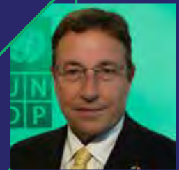
Achim STEINER Administrator UNDP