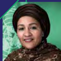
Amina J. MOHAMMED Deputy Secretary General United Nations