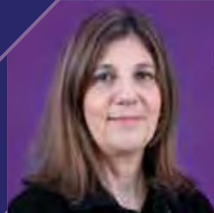
C20 Steering Committee Member; Advocacy Officer Global Health Italian Network