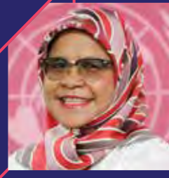
Maimunah SHARIF Under-Secretary- General and Executive Director UN-Habitat