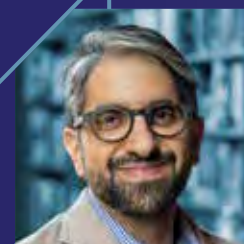
Sultan AL QASSEMI Founder Barjeel Art Foundation