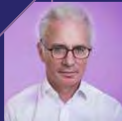
Peter SANDS Executive Director Global Fund Secreteriat